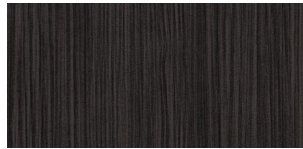
Black Pine Color Code: CDBP