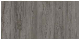
Stone Wood Color Code: CLSW