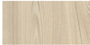
White Elm Color Code: WLWE