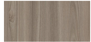
River Elm Color Code: WDRE