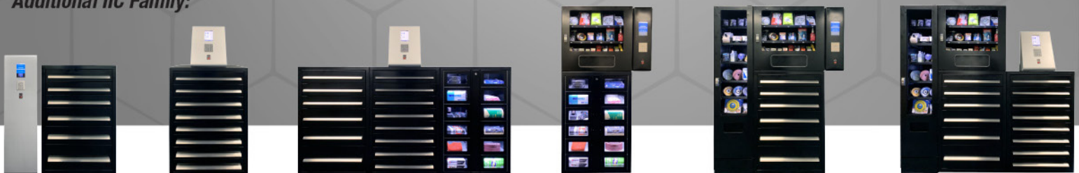
IQIIC, IQ6DR IQIC, IQ8DR IQIC, IQ6DR, IQ8DR IQ12 IQ3, IQ12 IQ970, IQ3, IQ6DR IQ970, IQ3, IQIC, IQ6DR, IQ8DR