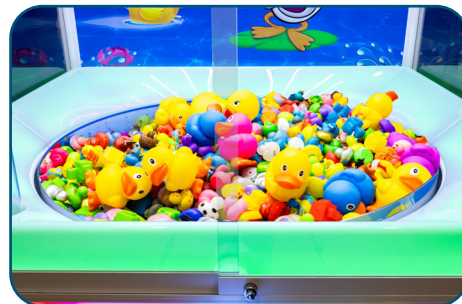
LARGE RUBBER DUCK FILL COMPATIBLE