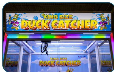
EYE CATCHING MARQUEE