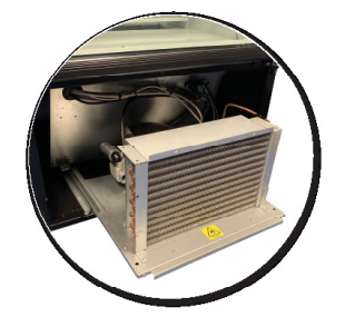
CoolBlu EZ Lift Refrigeration Module