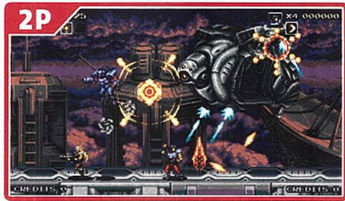
BLAZING CHROME AC