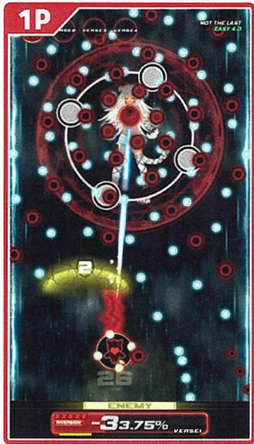
NOISZ ARC CODA