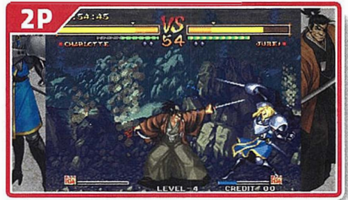
SAMURAI SHODOWN V PERFECT