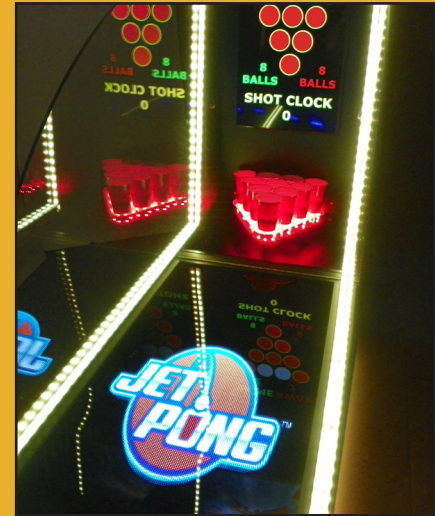
LED rear and surface video