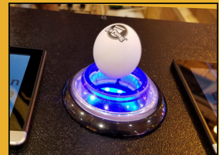
Ball pops up to take your shot