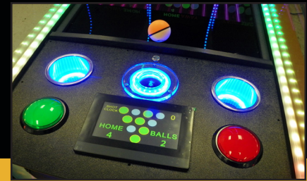
Players' console close-up

Specifications and dimensions are subject to change. Images are of prototype products. Contact your distributor for information.