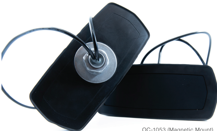
OC-1052 (Direct/Screw Mount)

Ideal when vandal resistance is important and for mounting in outdoor settings.