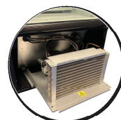
CoolBlu Refrigeration Module