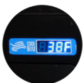
Front Visible Temp