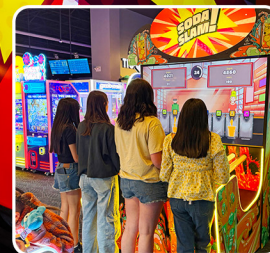
Total Plays May 29-June 4, 2025