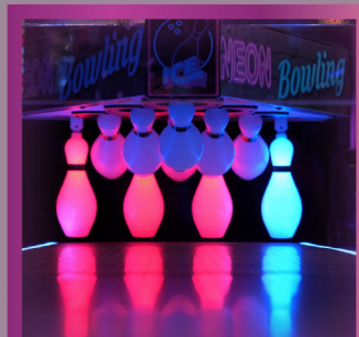
Time Your Shot

The goal of this mini-game is to get a "strike" on all 3 rolls. On the first throw the player will have to knock down the first 3 pins, on the second throw 6 pins and the third throw all 10 pins.