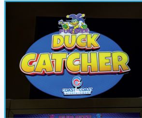
ATTRACTIVE LIGHTED MARQUEE