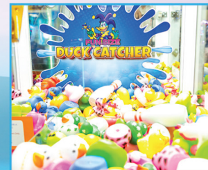
PERFECT CRANE FOR SMALL TOY ITEMS