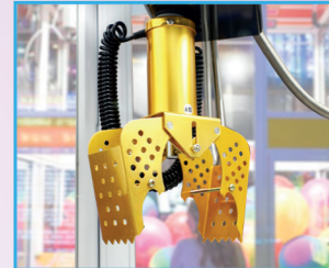
GOLDEN SCOOP CLAW