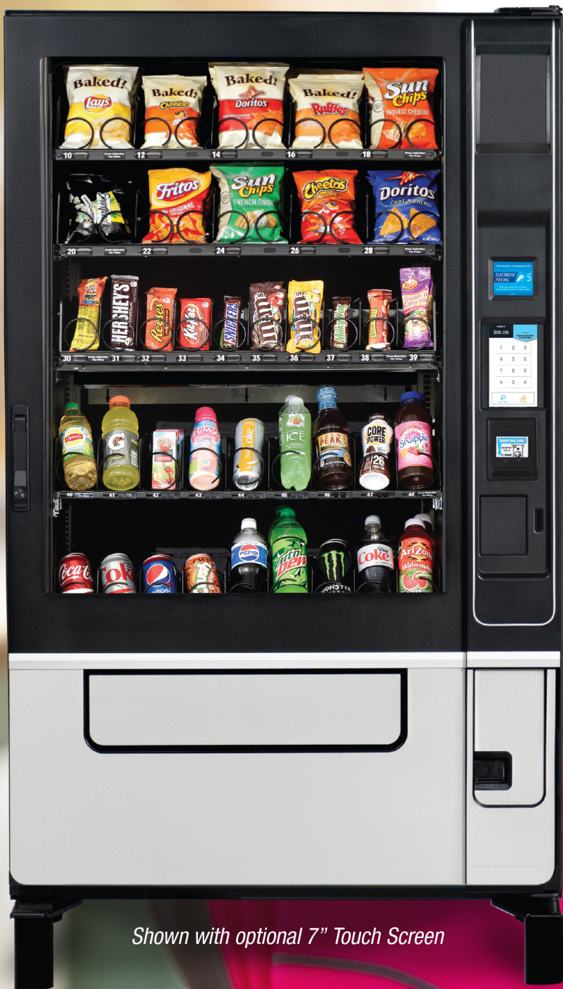
Shown with optional 7" Touch Screen