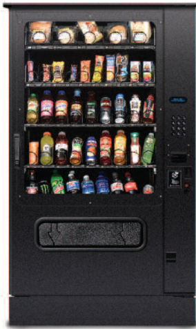
Shown with optional kick panel.