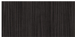
Black Pine Color Code: CDBP