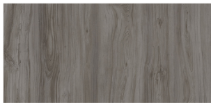
Stone Wood Color Code: CLSW