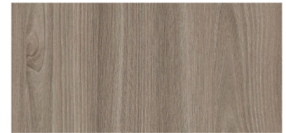
River Elm Color Code: WDRE