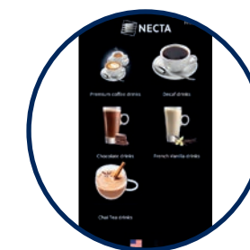
A SIMPLIFIED NAVIGATION BY CUSTOMIZABLE CATEGORIES