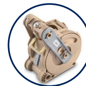
AN ESPRESSO BREW GROUP FOR A PERFECT COFFEE