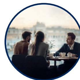
A PERSONAL TOUCH TO YOUR COFFEE BREAK