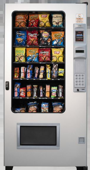
4-Wide Classic Snack Optional Silver