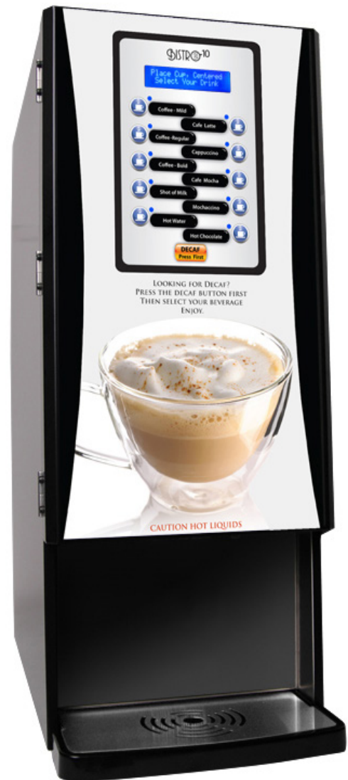
Bistro 10-T PN: 123033-BPC