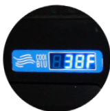
Front Visible Temp