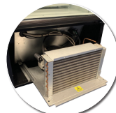
CoolBlu Refrigeration Module