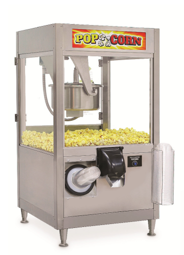
Countertop ReadyPop Unit