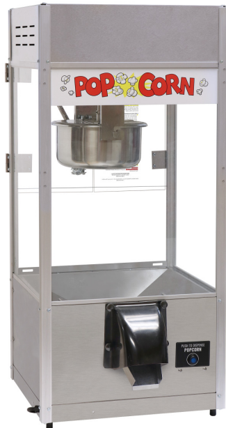
Model 2783-00-000 Front Counter Unit shown