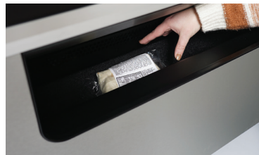
Sell Salads, Sandwiches and more!