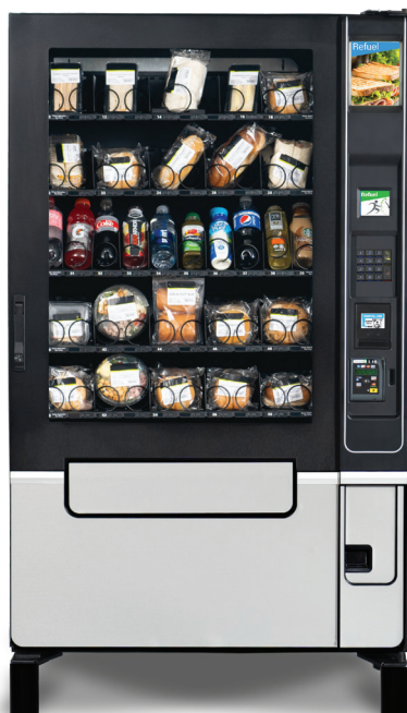
POS Window Featured Optional