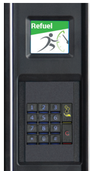
Braille Keypad Standard