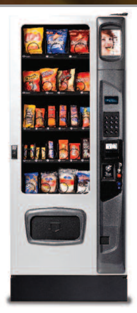
Shown with optional ADA door, custom door color & kick panel.