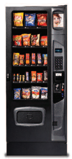
Shown with optional ADA door, iCart touch screen & kick panel.