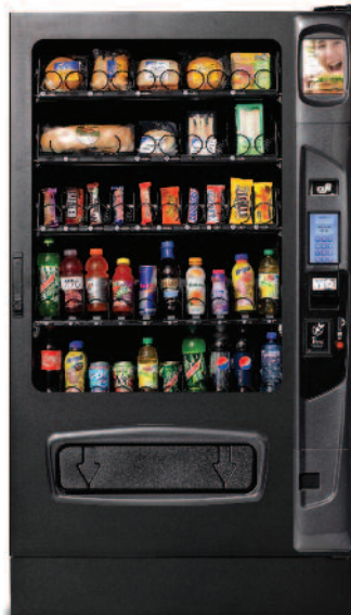
Shown in black with ADA door, iCart touch screen and kick panel options.