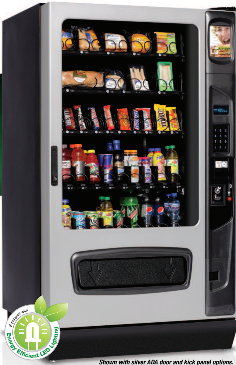
Shown with silver ADA door and kick panel options.

The Alpine ST5000 glass front refrigerated food & beverage merchandiser provides the largest dispensing capability with class leading energy efficiency. Vend sodas, juices, milk, yogurts, and other foods best served cold from one versatile package.